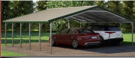
WXL Vertical Roof Style