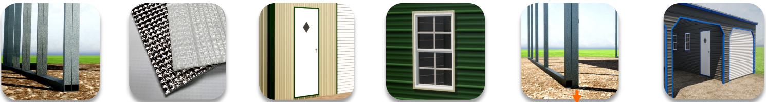
2' Under Ground