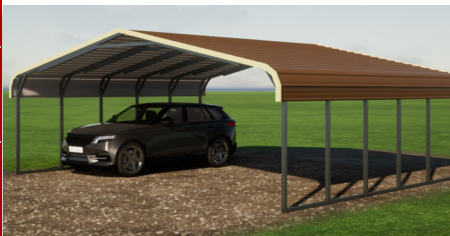
WXL Regular Style