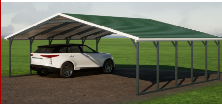
WXL Boxed Eave Style