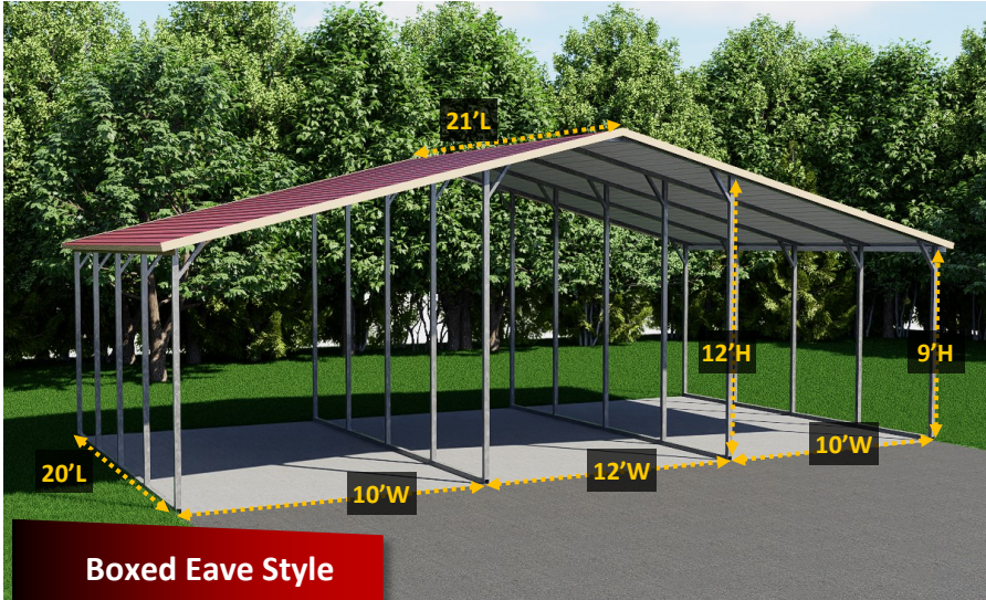
Boxed Eave Style