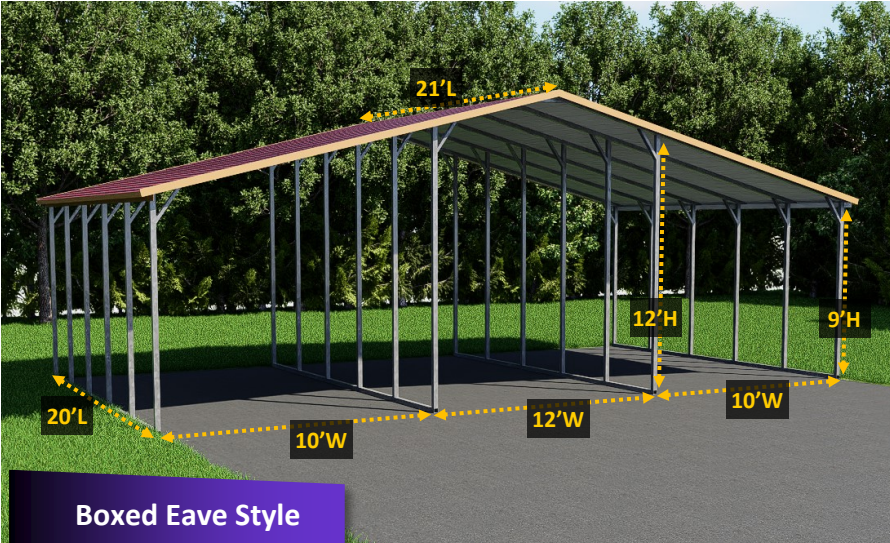
Boxed Eave Style