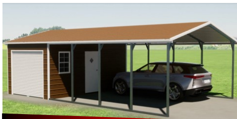
Boxed Eave Style