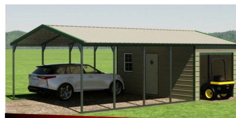
Vertical Roof Style