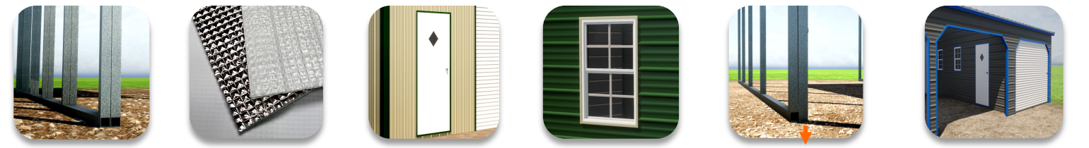
2 Under Ground