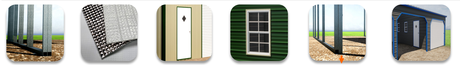
2' Under Ground

FRAME OUTS WINDOW $80.00 EACH WALK DOOR $90.00 EACH DOOR FRAME OUTS 6'W-12'W ON END $150.00 EACH 13'W-16'W ON END $300.00 EACH 6'W-12'W ON SIDE $200.00 EACH 13'W-16'W ON SIDE $400.00 EACH ON ENDS: MUST CLOSE FIRST FOR FRAME OUTS, IF NO PANELS WANTED ON END (FRAME END ONLY) DISCOUNT 20% FROM CLOSED END PRICE. 16FT WIDE MAX ON END AND SIDE DOOR OPENINGS