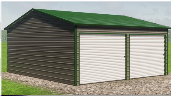
Boxed Eave Style

BOXED EAVE HAS 6" ROOF OVERHANG ON FRONT, BACK AND SIDE EAVES.