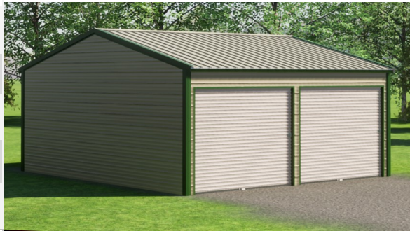
Vertical Roof Style

VERTICAL ROOF HAS NO OVERHANG ON FRONT OR BACK JUST ON SIDE EAVES.