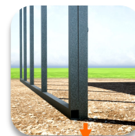
2 Under Ground